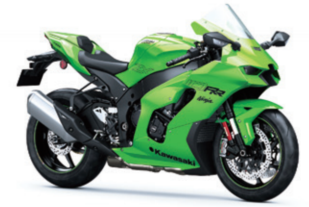
Kawasaki Ninja ZX-10RR

Kawasaki Ninja ZX-10R / Ninja ZX-10RR 2021 model OEM chain supplied by RK