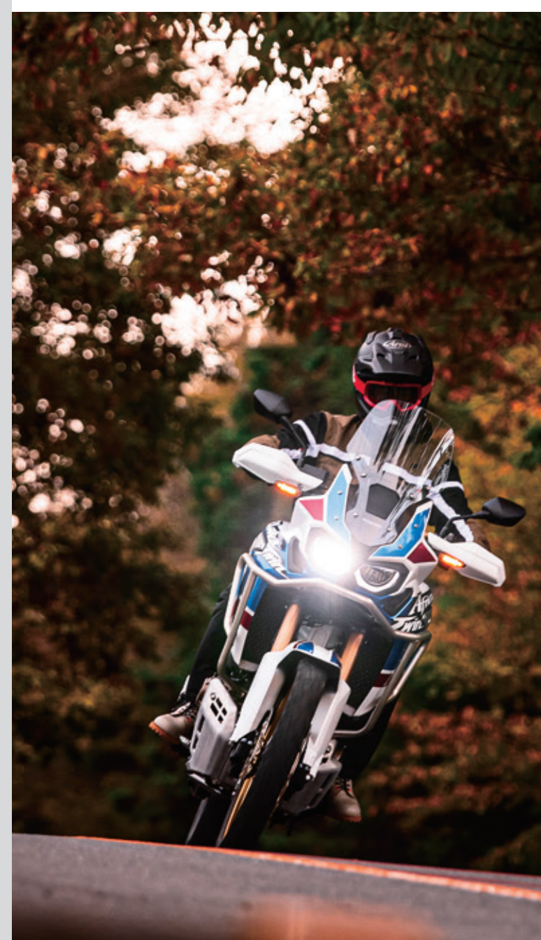
Being the Best is a Commitment