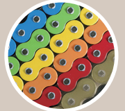
Gold and Solid Colors